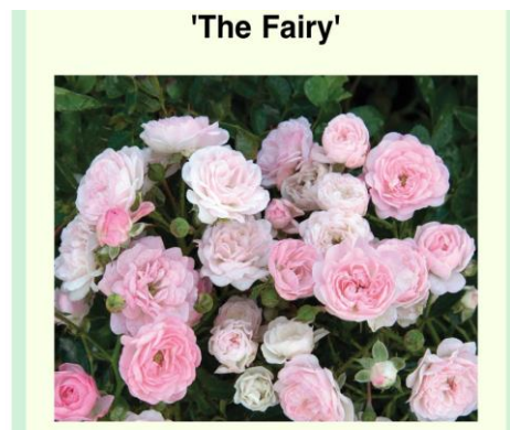
One of the roses offered at the upcoming auction.

There will be a seed and scion exchange in Mountain Ranch on February 25, 2024 from 11 am to 4 pm. Please see flyer above for details.